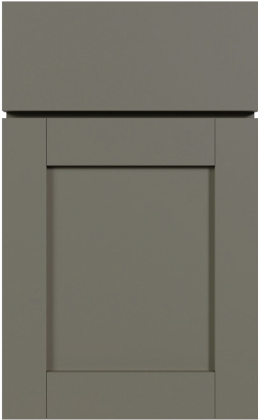
Shown in Fossil Grey