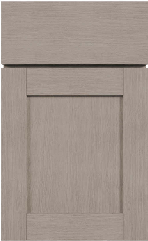
Shown in Milan