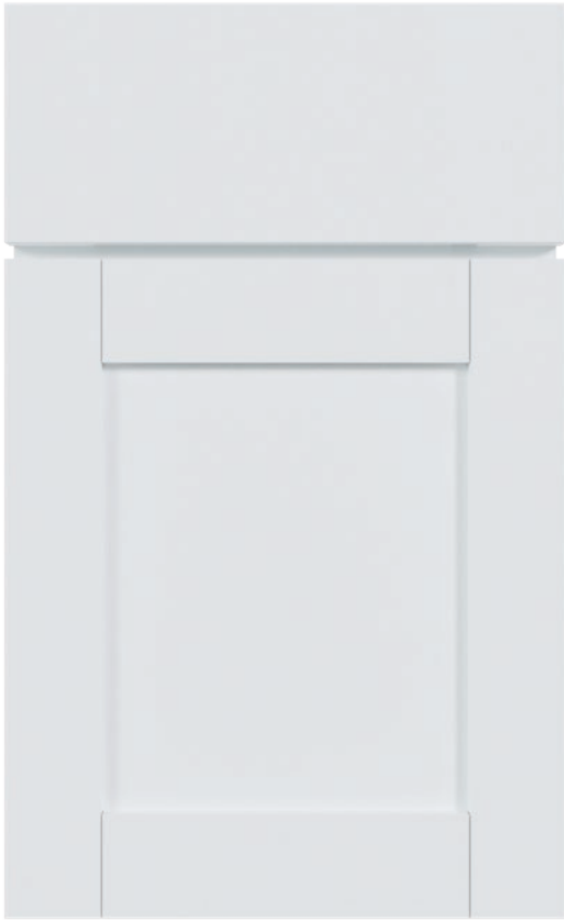
Shown in Perfect White