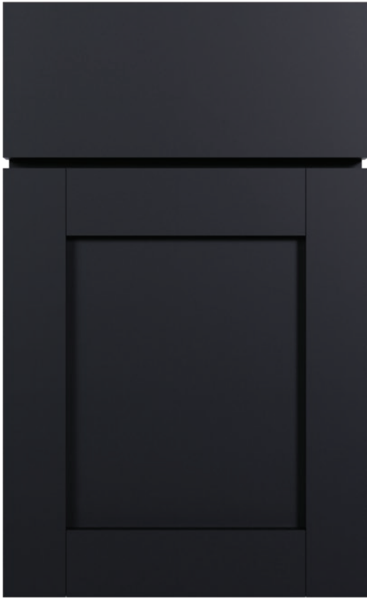
Shown in Velvet Black