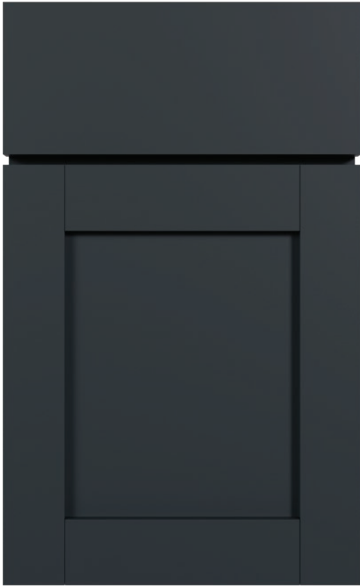
Shown in Velvet Blue